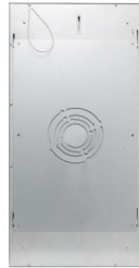
Surface Mount Bracket Included